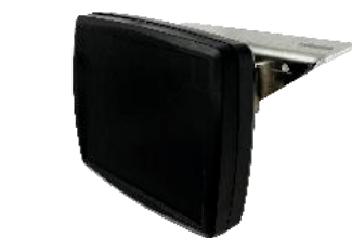
Vehicle or speed detector