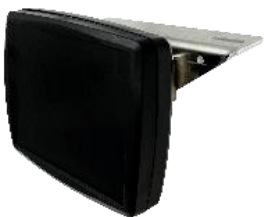
Vehicle or speed detector