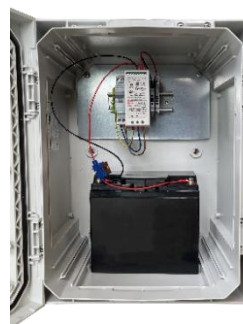
Street Lighting box