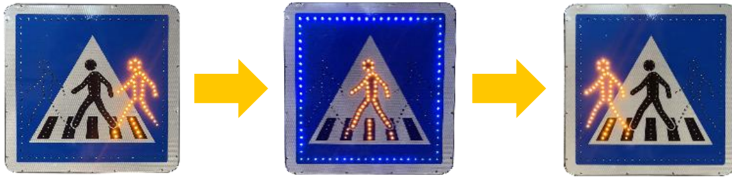
Road sign with a pedestrian symbol scrolling in orange LEDs

Scroll control board in a waterproof PVC box