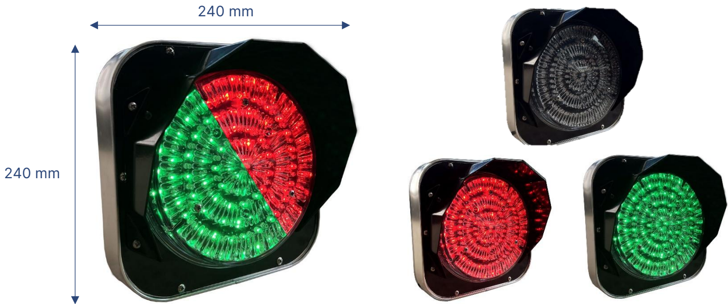
A single light of 190 LEDs with two colors : red and green