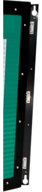
Wall-mounted Stainless steel hinge closure