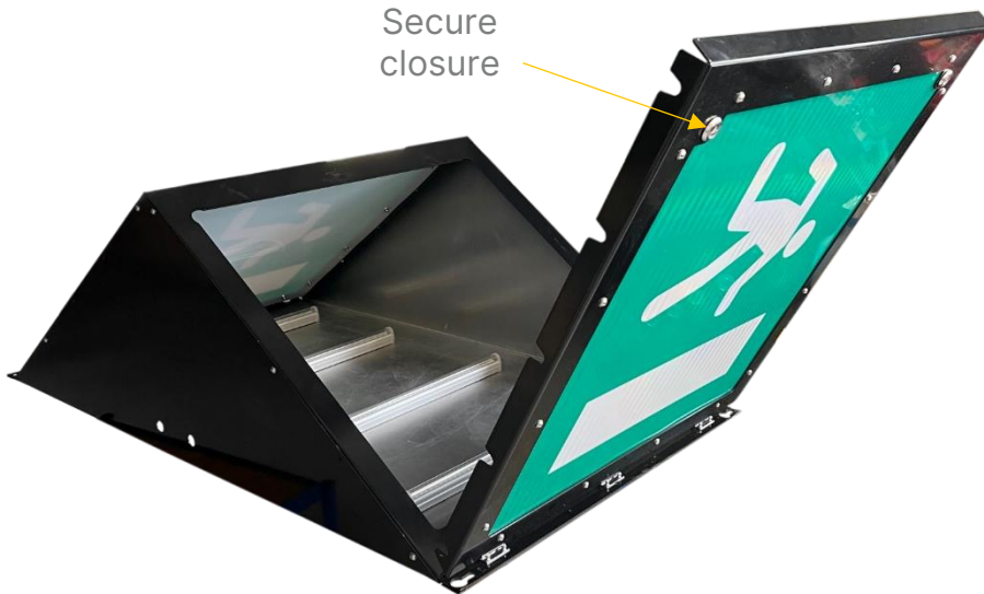
Interior view Lighting with wide-angle LED tubes Or LED bulbs

LED tube details : IP67 + waterproof fitting